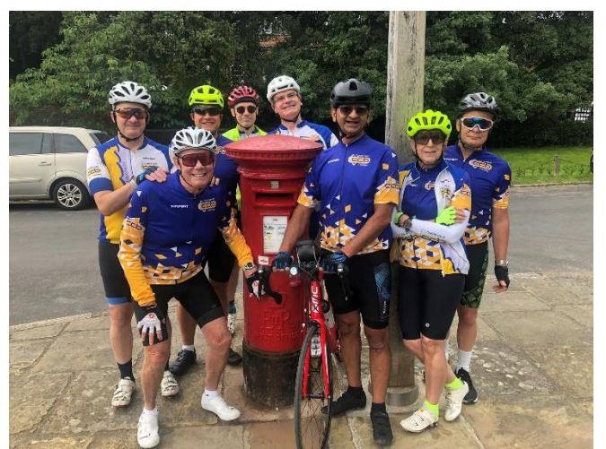
Sunday morning wouldn't be the same without a photo at the post box